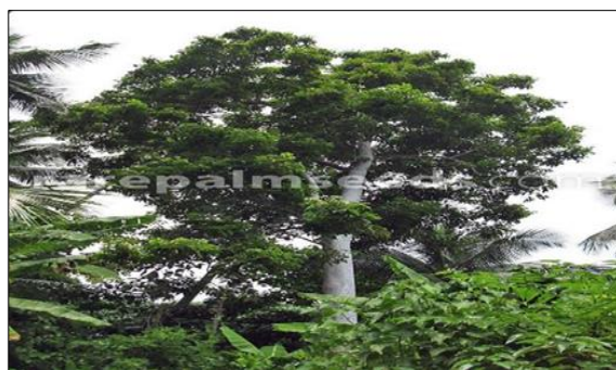
Figure 1 The whole tree of Canarium schewenfurthii

The plant material used consisted of the bark of the Canarium schewenfurthii trunk. They were collected in Bangangté (Western Region) in April 2022 and identified in the National Herbarium of Cameroon at number 40804 / HNC. Our samples have been dried out of the sun at room temperature for 21 days, then sprayed with a three-phase VINCO® Model Y2-132S1-2.