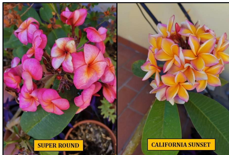
Figure 1 Details of the Plumeria frangipani plants used in the trial

In this study, the possibility of using INORT, a biostimulant based on Inula viscosa L. ( Dittrichia viscosa L.), algae and microorganisms to improve growth, defence against Fusarium oxysporum and resistance to water stress, on Plumeria frangipani plants grown in open field was evaluated.